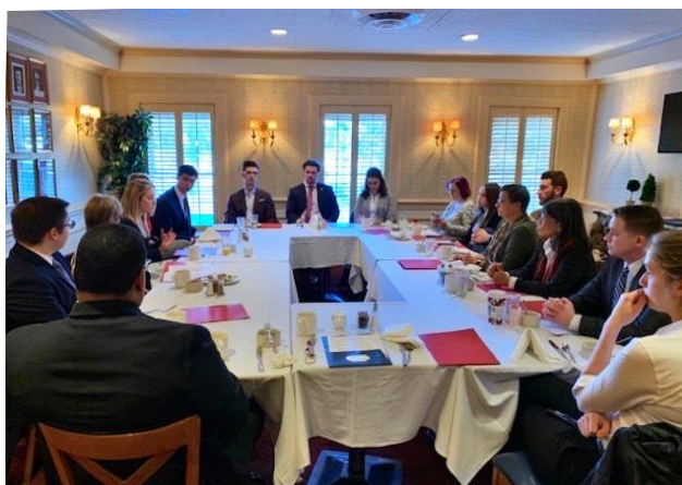
Patient representatives from participating organizations attend an advocacy training and strategy session before departing for meetings on Capitol Hill.

On Wednesday, November 13 th , 2019, the Digestive Disease National Coalition (DDNC) and 19 other voluntary and professional healthcare organizations coordinated a National Day of Advocacy to encourage federal legislators to address step therapy reform by supporting the Safe Step Act (H.R. 2279/S. 2546).