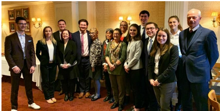
2019 Step Therapy National Day of Advocacy Participants

Digestive Disease National Coalition | American College of Gastroenterology | American College of Rheumatology | American Gastroenterological Association | American Society for Gastrointestinal Endoscopy | American Society for Parenteral and Enteral Nutrition | Arthritis Foundation | Association of Gastrointestinal and Motility Disorders | Beyond Celiac | Crohn’s & Colitis Foundation | Global Healthy Living Foundation | IBD Moms | International Foundation for Gastrointestinal Disorders | National Eczema Association | National Pancreas Foundation | National Psoriasis Foundation | The Oley Foundation | Pulmonary Hypertension Association | United Ostomy Associations of America | U.S. Hereditary Angioedema Association