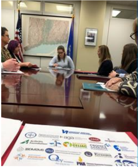
Patient advocates and representatives met with Congressional offices to bolster support for the Safe Step Act.