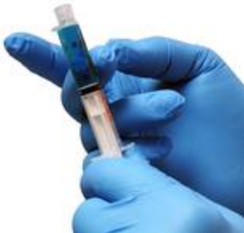
Carefully tap or flick the syringe to remove the air bubble to remove air bubbles.

Step 4. When using the ENFit medication straw, make sure there are no air bubbles in the syringe. Air bubbles from the straw may fill the lower end of the syringe. Carefully tap or flick the syringe to remove the air bubble before removing from the medication straw or the syringe to remove air bubbles.