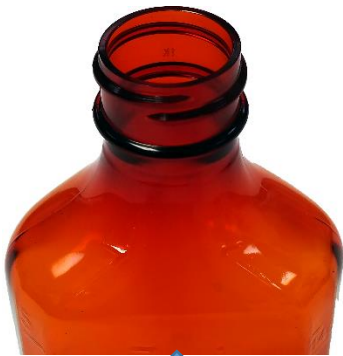
Liquid medication bottle with open top

Below are examples of the current tops of medication bottles. These will NOT work directly with the new ENFit syringes. This procedure will demonstrate three ways to fill the ENFit syringes (Bottle fill cap, medication straw, or medication cup).