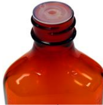
Liquid medication bottle with press-in oral syringe adapter