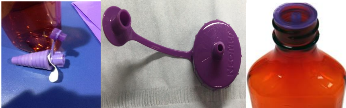
Three examples of ENFit Compatible Bottle Fill Caps

Step 1. Make sure that the medication bottle has an ENFit compatible fill cap such as the ones shown above.