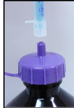
When complete, turn bottle right side up and remove syringe