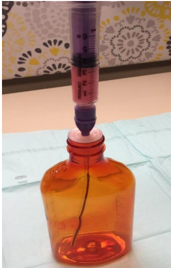
ENFit Syringe with Medication Straw in Liquid Medication Bottle

Step 3. Position the straw in the bottle and draw up the medication to the desired dose. When that is done, take the straw off the syringe and gently tap the straw to remove any medication that is on/in the straw.