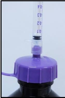
Attach the syringe to the bottle adapter

Step 2. With the ENFit fill cap attached, connect the ENFit syringe. Gently turn the medication bottle upside down. In a gentle but quick motion, pull and push back the syringe plunger to cycle it once or more (this helps to eliminate air bubbles). Then pull the plunger back to withdraw the desired medication dose. When ready, return the bottle to its upright position and remove the syringe.