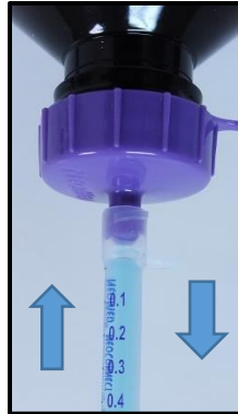
Draw solution into the syringe. IMPORTANT: To help remove air bubbles, quickly cycle the syringe plunger back and forth a few times.