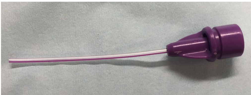
Example of a Medication Straw

Step 2. Connect the ENFit compatible end of the medication straw to the medication syringe, insert the straw into the medication bottle through the opening of the existing bottle adaptor or directly into the bottle mouth.