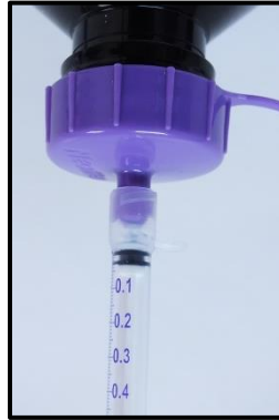
Turn the bottle upside down